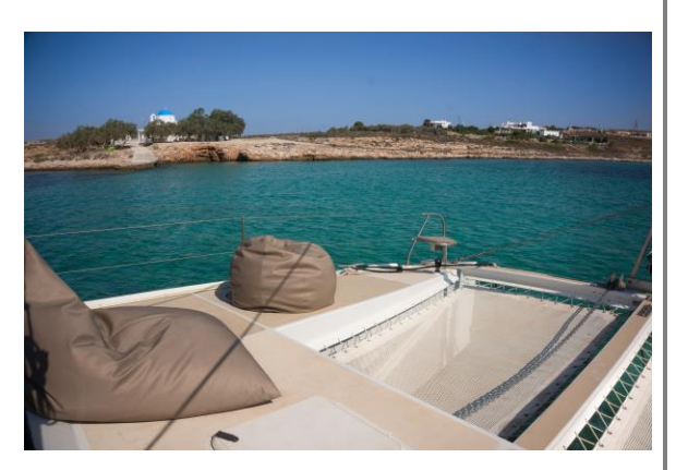
Front deck relaxing area