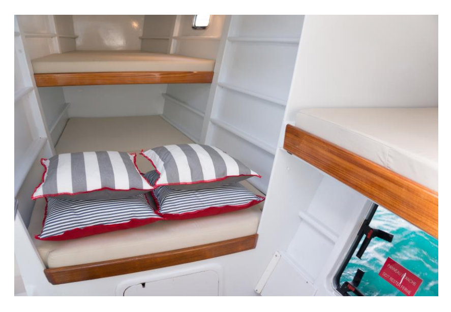
Three bunks cabin